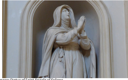
Saint Angela of Foligno Saint of the Day for January 8, 2023